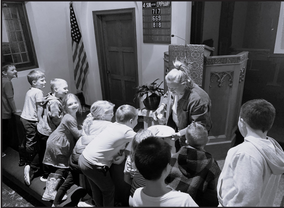
Wednesday school children taking part in activities to learn more about their faith.